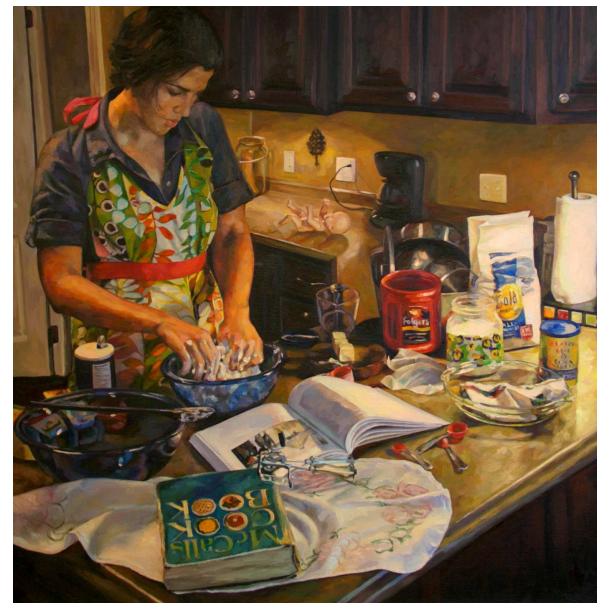
Time to Think, 2012 45" x 45" Oil on Canvas