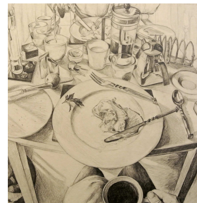
(top right) The Conversation, 2013, Graphite on Paper 32.5" x 31.5"