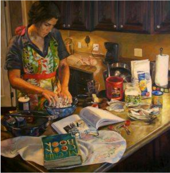
Time to Think , 2012, 45" x 45", oil on canvas.