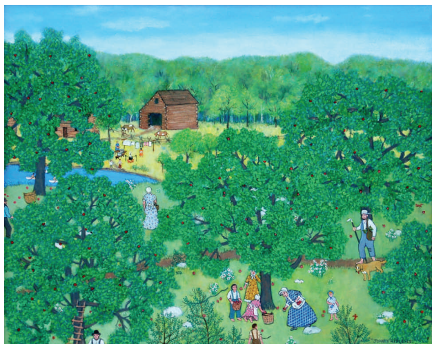
Johnny Appleseed, 2008, 24" x 30" oil on canvas