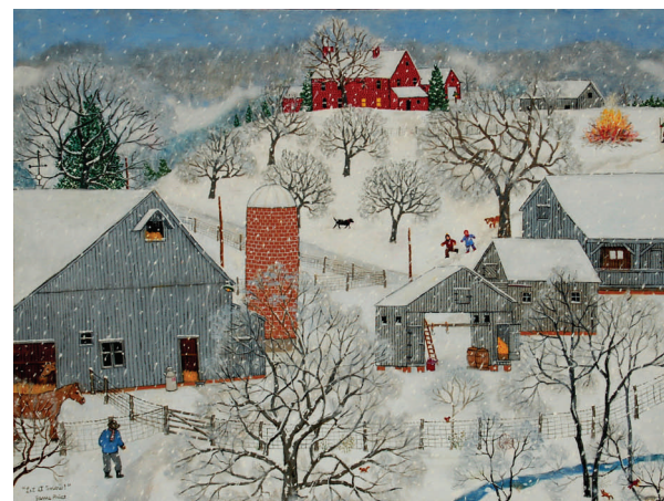
Let it Snow, 2012, 30" x 40" oil on canvas