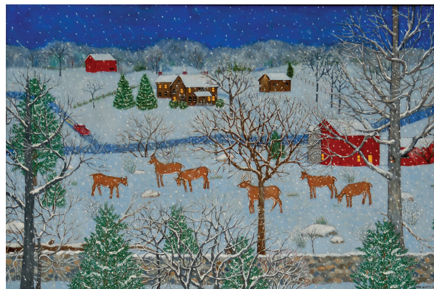
A Winter Night, 2011, 24" x 36" oil on canvas